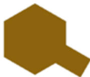
XF-72 Brown (JGSDF)