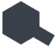
XF-66 Light Grey