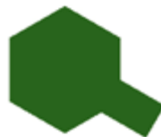
XF-73 Dark Green (JGSDF)