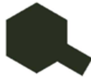
XF-58 Olive Green