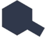
XF-61 Dark Green