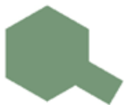
XF-71 Cockpit Green (IJN)