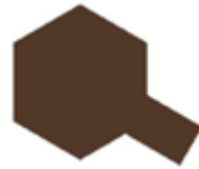
XF-68 NATO Brown