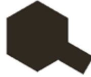
XF-64 Red Brown