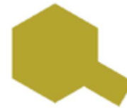
XF-60 Dark Yellow