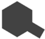
XF-56 Metallic Grey