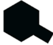
XF-63 German Grey