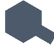
XF-65 Field Grey