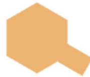
XF-59 Desert Yellow