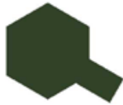
XF-67 NATO Green