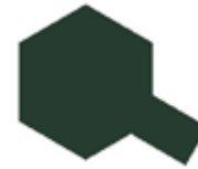
XF-70 Dark Green2